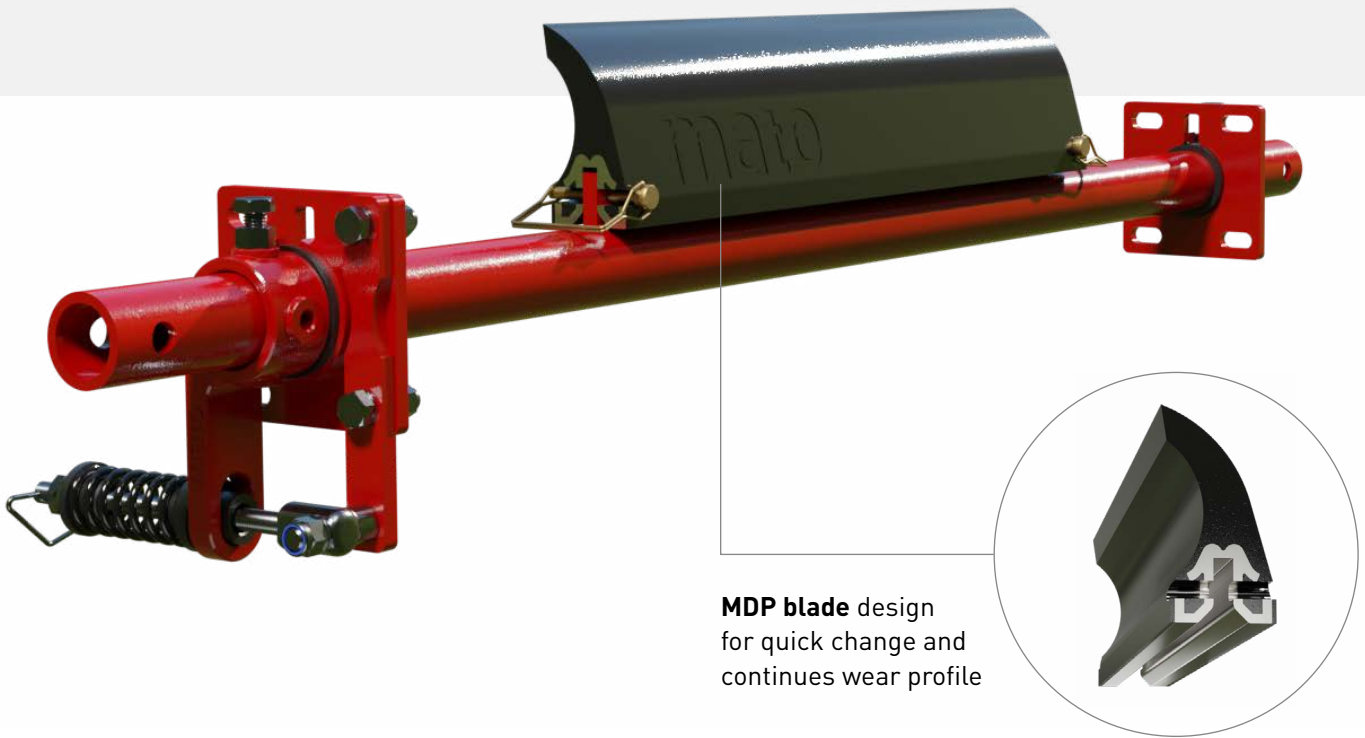
MDP blade design for quick change and continues wear profile

The MDP - MATO Drop-on Primary cleaner is the simplest primary cleaner available on the market, with its easy compression spring application for constant tensioning and reduce the need for adjustment.